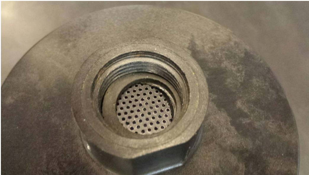
Incorrect position of plate and gasket shown above ↑

the bottom of the threads with the black perforated metal plate completely underneath the gasket. Using the pick tool, center the black perforated metal plate so that the desiccator fill hole is completely covered with the plate. The first photo below shows the initial positions of the plate and gasket which are undesirable. The second photo shows the correctly installed and positioned plate and gasket.