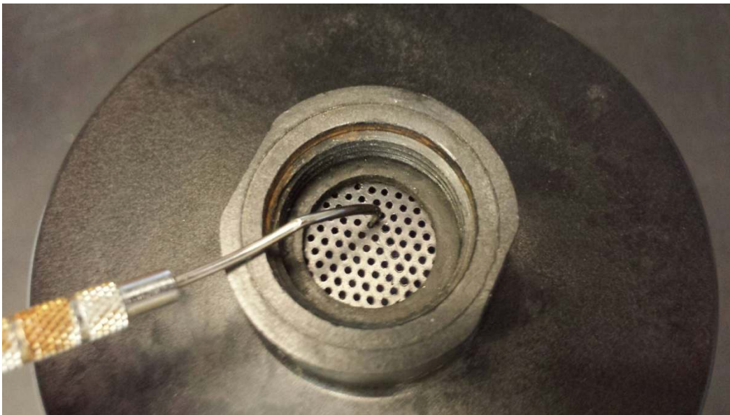
Correct position of plate and gasket shown here ↑