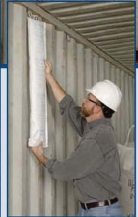
Container Dri® II protects cargo during shipping by preventing “container rain” that can damage goods. It is available in various convenient configurations. (Top: Container Dri II Plus, L: Strip, R: Pole)