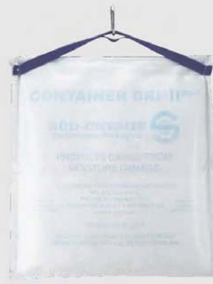
Container Dri® II-Plus