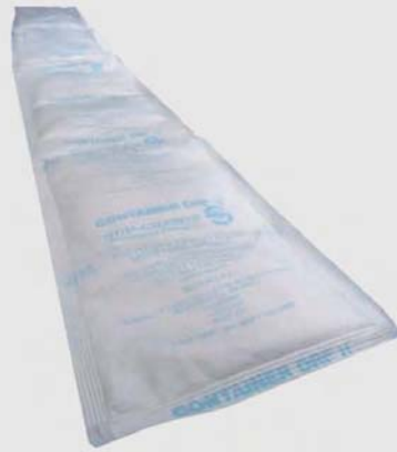
Container Dri® II-Strip