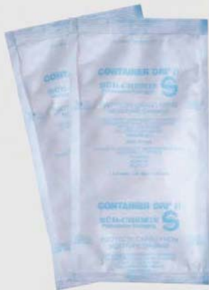
Container Dri® II

Transport with dew point control Dew point temperature is kept below surface temperature, preventing condensation and moisture damage.