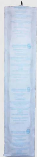
Container Dri® II-Pole